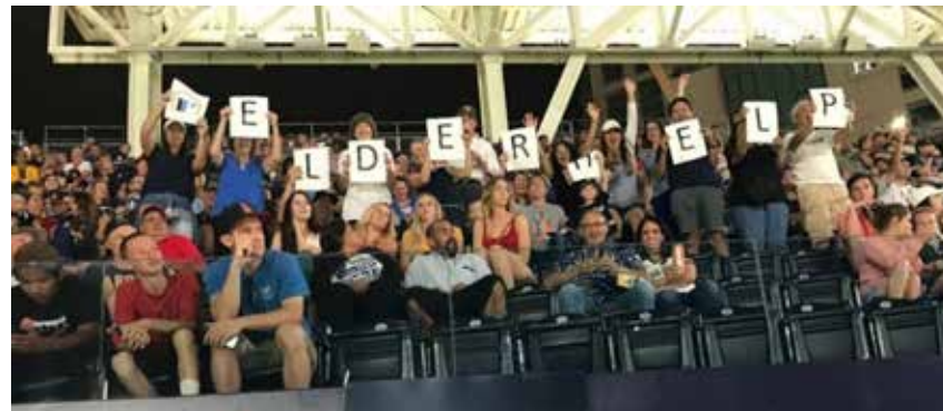
Volunteers and guests enjoyed a night at the Petco Park, thanks to our friends at Mission Federal Credit Union.