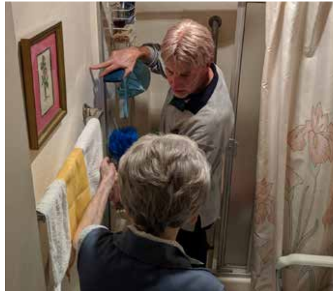
Our Home Safety team takes time with each client to carefully place safety bars where they will be most useful.