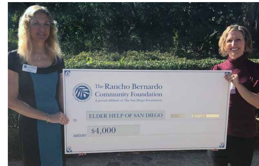
We are grateful for support from The Rancho Bernardo Community Foundation.