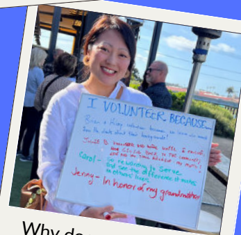
Why do you volunteer?