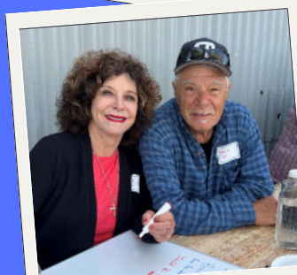
Celebrating those who support our seniors